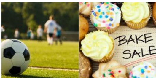
Launch of the "Host an Event for Us" platform to enable donors to support AMC through their private initiatives. [...]