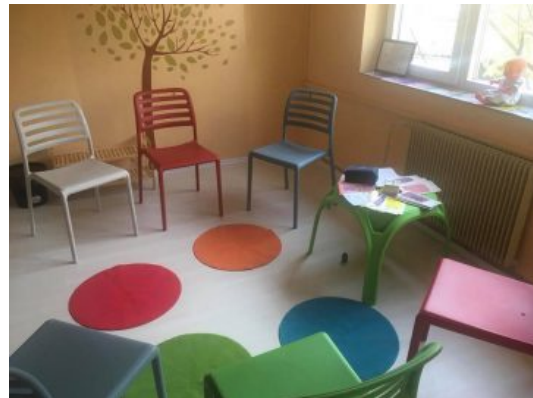
7th Women's Health Resource Center: Mothers' Classes , was opened in Peja , at the Main Family Medicine Center, the Emergency Facility – the Vaccination Center. [...]