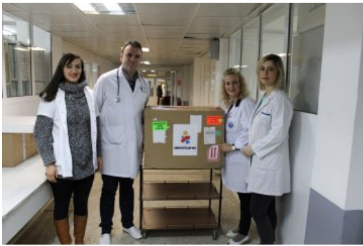
Delivery of Survanta , Lifesaving Medication, to the University Clinical Center of Kosovo's Neonatology Clinic . [...]