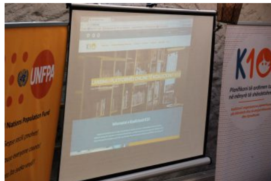
The K10 Coalition officially launches its online platform. [...]