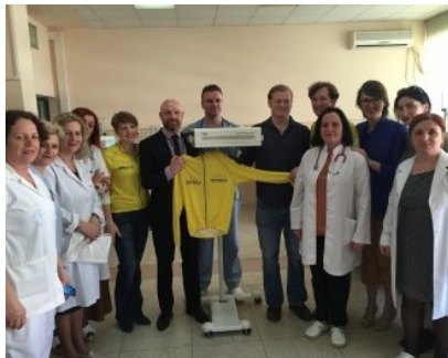
Photo Therapy Lamps arrive in the Neonatology Intensive Care Unit in Prishtina